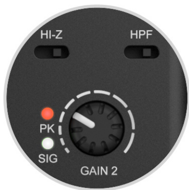
Channel switches and the GAIN knob

All switches are active when the lever is moved to the right. The levers are recessed to prevent accidental adjustment. Use a thin, sharp object, such as a paperclip, toothpick or a pen tip to slide the lever to the right to activate the feature.